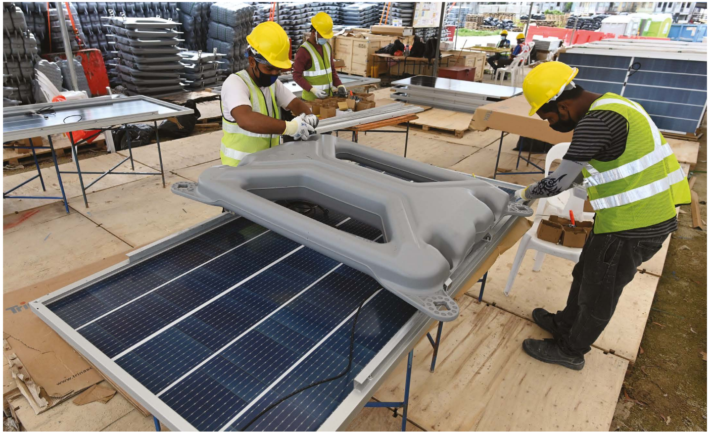
Workers fix a floater onto a solar panel to be deployed on Tengeh reservoir in Singapore.