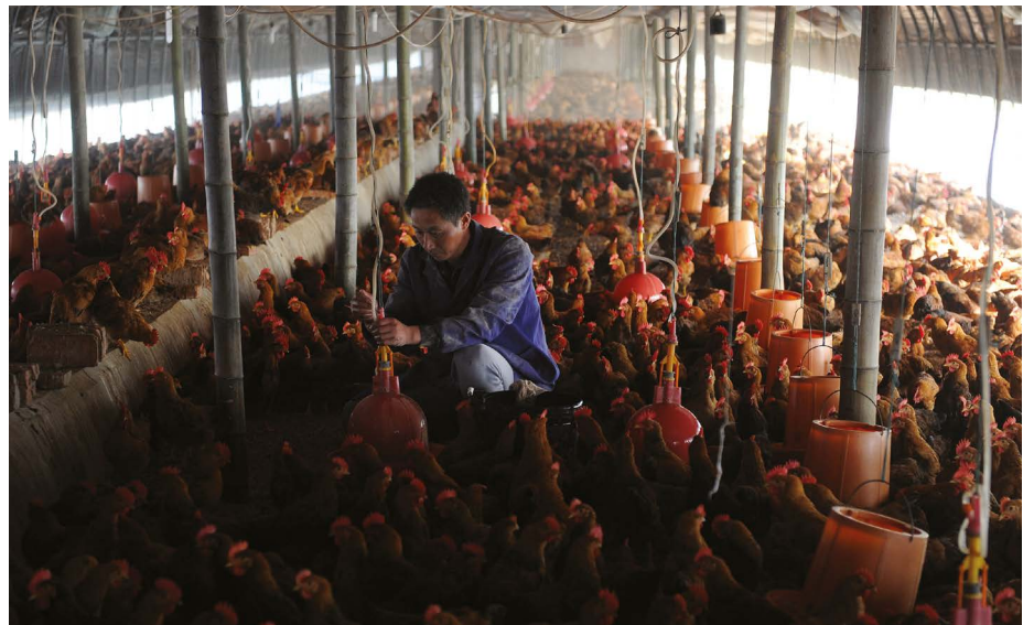
A worker in a crowded chicken farm in Anhui province, China.

Such strategies to prevent spillover would reduce our dependence on containment measures, such as human disease surveillance, contact tracing, lockdowns, vaccines