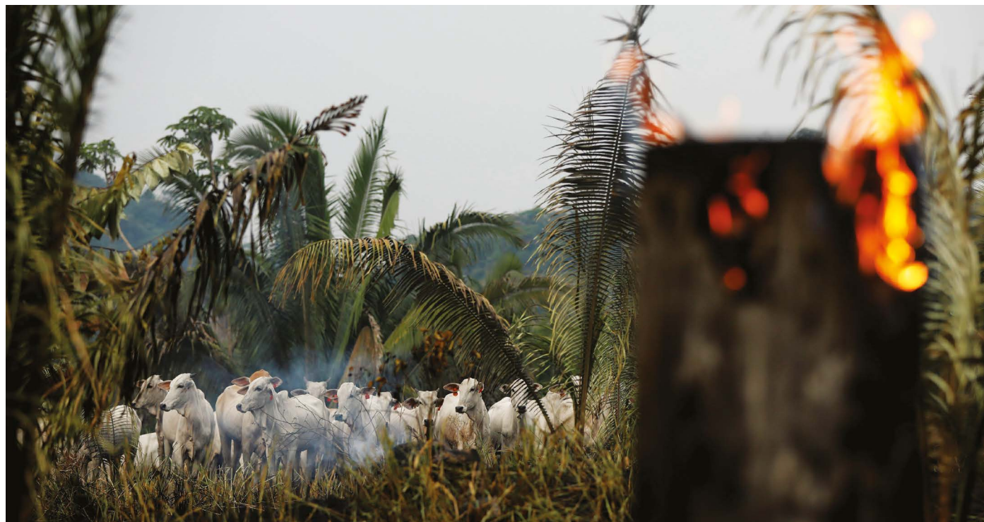
Cattle encroach on the Amazon rainforest in Brazil as trees are burnt to clear land for grazing.