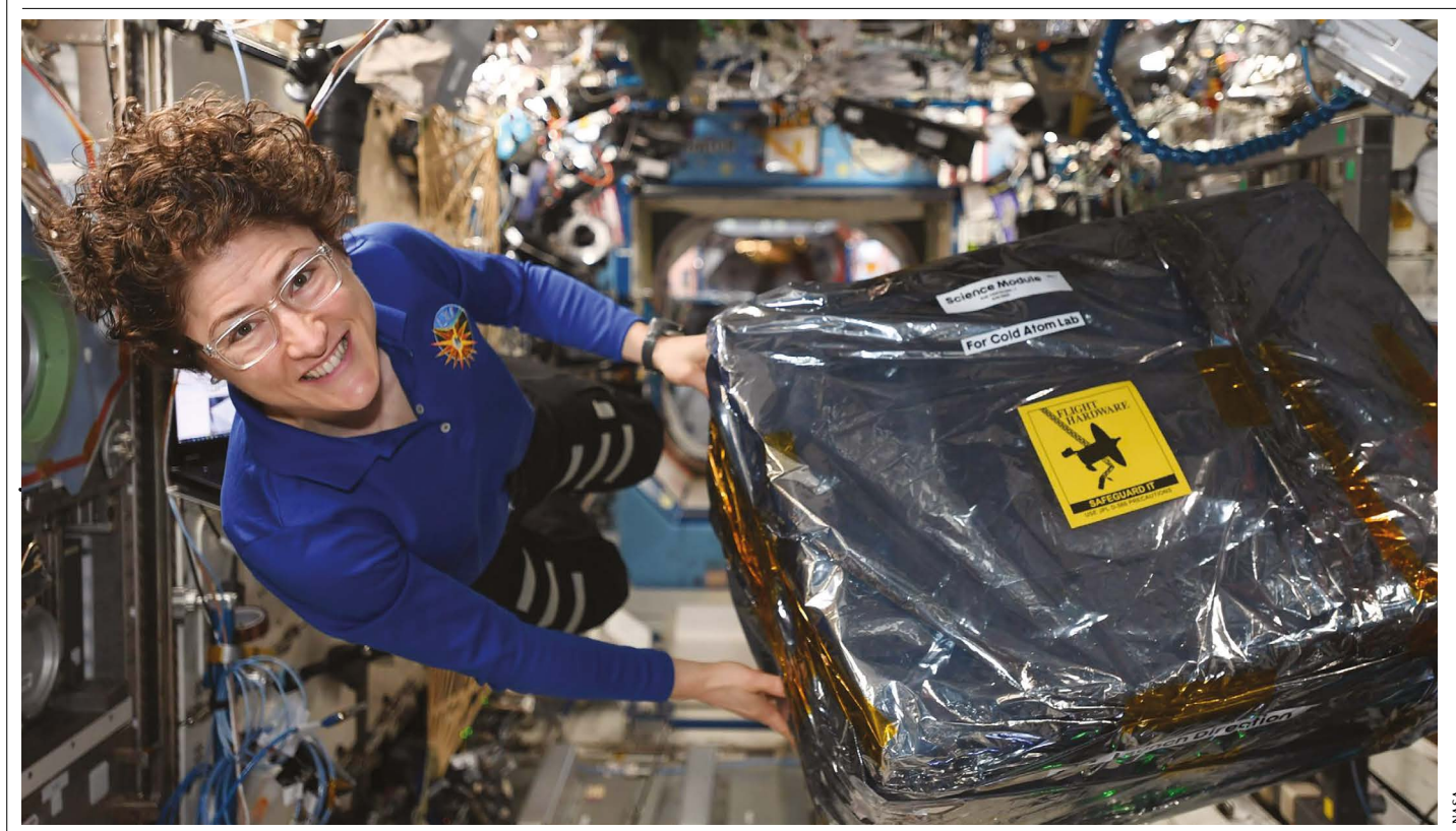
Christina Koch on the International Space Station, with hardware used to probe the quantum effects of gases chilled to almost absolute zero.