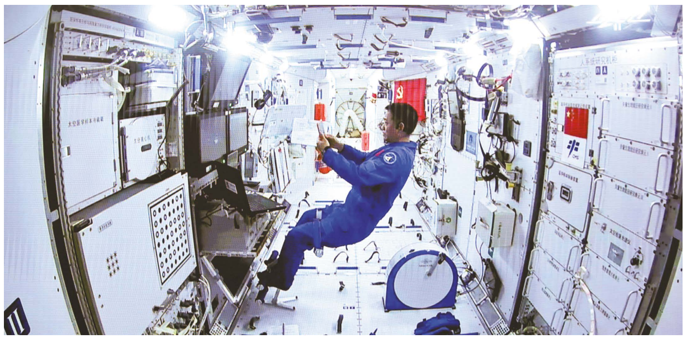
Chinese astronaut Nie Haisheng works inside the Tianhe module.