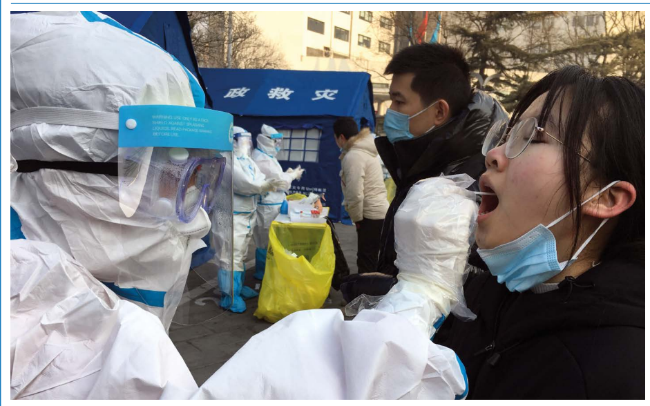
Local residents queue up for COVID-19 tests in Ditan Park, Beijing.

around 95% of adults. "Essentially all humans become infected," Houen says. The difference seems to be "whether you are able to control the infection during your lifetime".