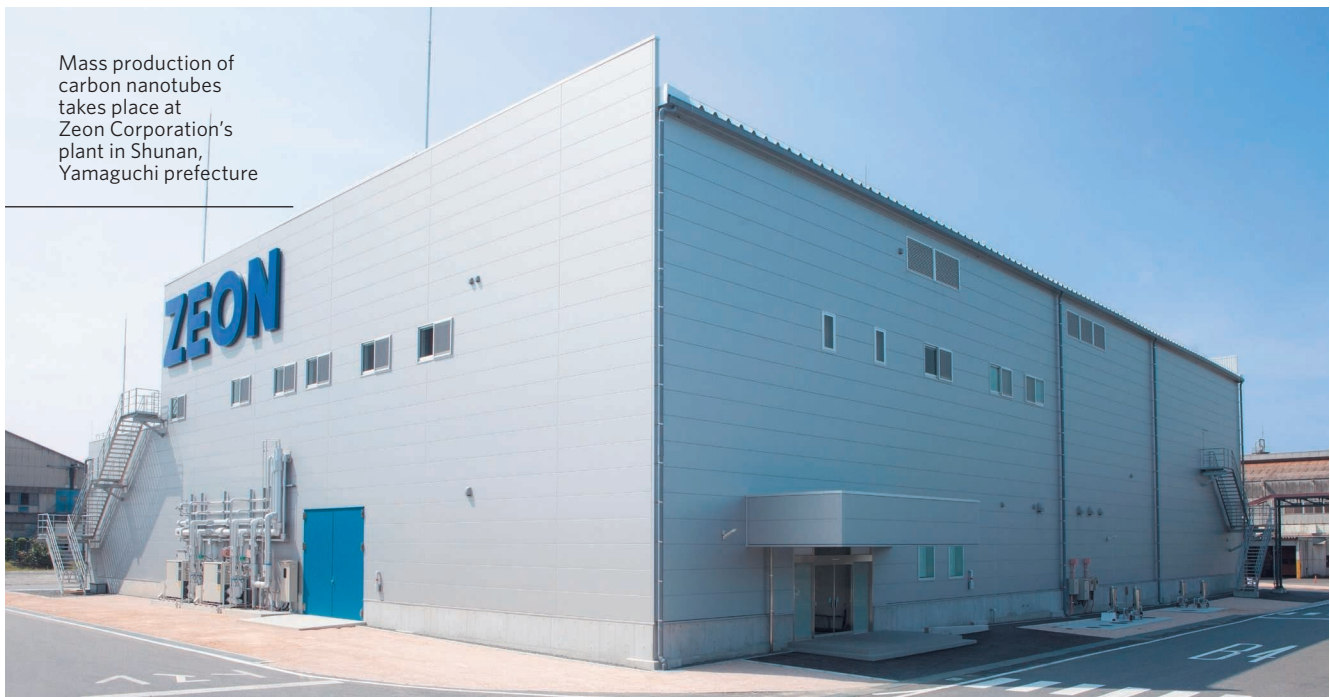
Mass production of carbon nanotubes takes place at Zeon Corporation's plant in Shunan, Yamaguchi prefecture

with the opening of their pioneering nanotube factory in the welcoming climate of Japan's Seto Inland Sea.