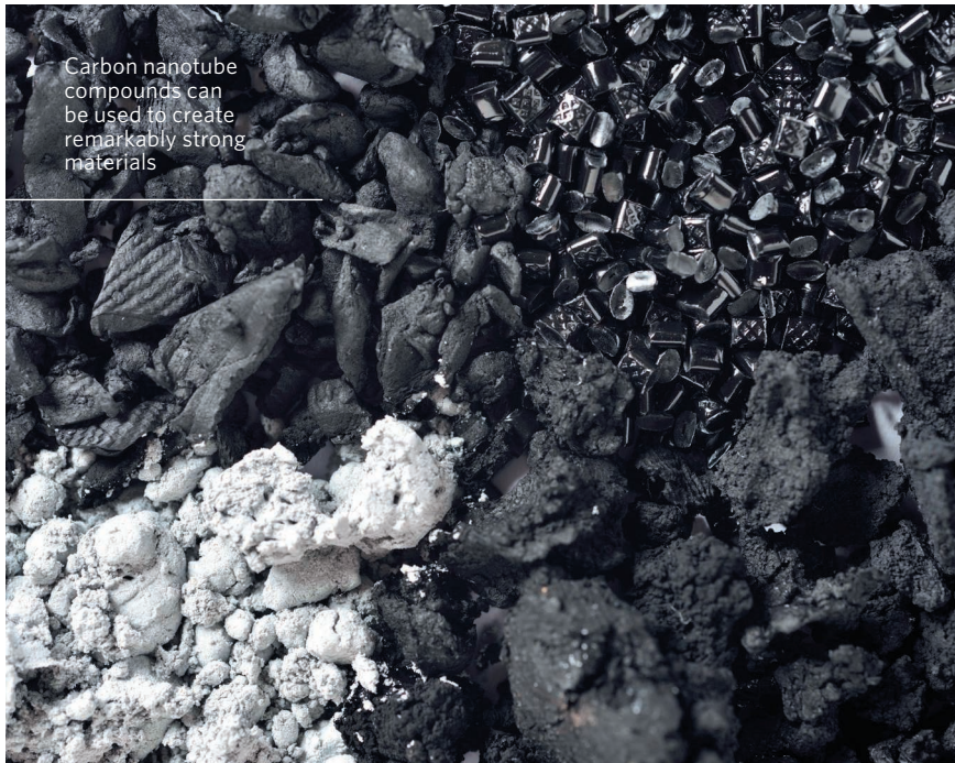
Carbon nanotube compounds can be used to create remarkably strong materials