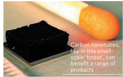
Carbon nanotubes, like in this small-scale 'forest', can benefit a range of products