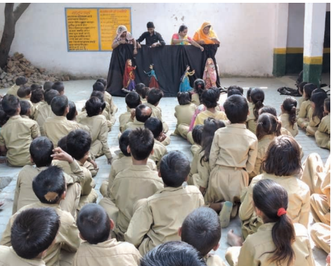
Training workshops for scientists and creative public engagement programs are central to India Alliance's vision of building a robust biomedical research ecosystem in India Top image represents hematopoietic stem cells (purple), progenitor cells (blue), niche cells (green) and cardioblasts (orange) in a Fruit fly.

Advertiser retains sole responsibility for content