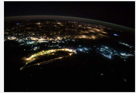
Lights show hundreds of fishing vessels in the sea surrounding Taiwan and the coast of mainland China in this image taken from the International Space Station Expedition 40 (July 27, 2014).

The Industrial Revolution was not a singular event that led to a new societal state. Instead, it involved several major transitions with the age of oil following the age of coal. Due to its liquid form, oil is much easier to use in combustion machines. It can be transported in pipelines, pumped from tankers to refineries, cracked and re-synthesized to produce a huge variety of fuels, lubricants and materials, from plastic chairs to medicines. The availability of petrol has also enabled private transport for large parts of our modern society – an important contribution to the personal freedom that everybody cherishes.