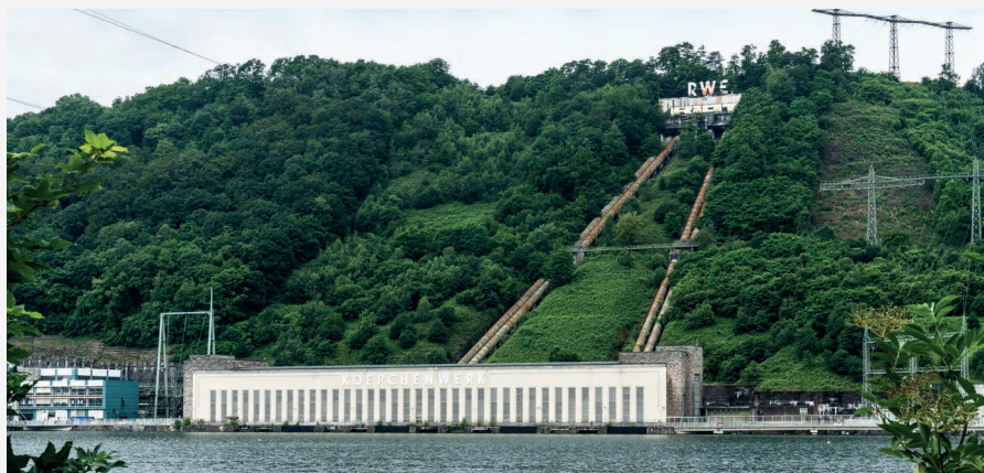
Koeppenwerk is one of the first large-scale pumped storage power plants to be built in Germany (1927–1930).

Yet, there is some reason for optimism. In a globally competitive economy, energy prices are major contributors to the competitiveness of any nation. Thanks to decades of dedicated