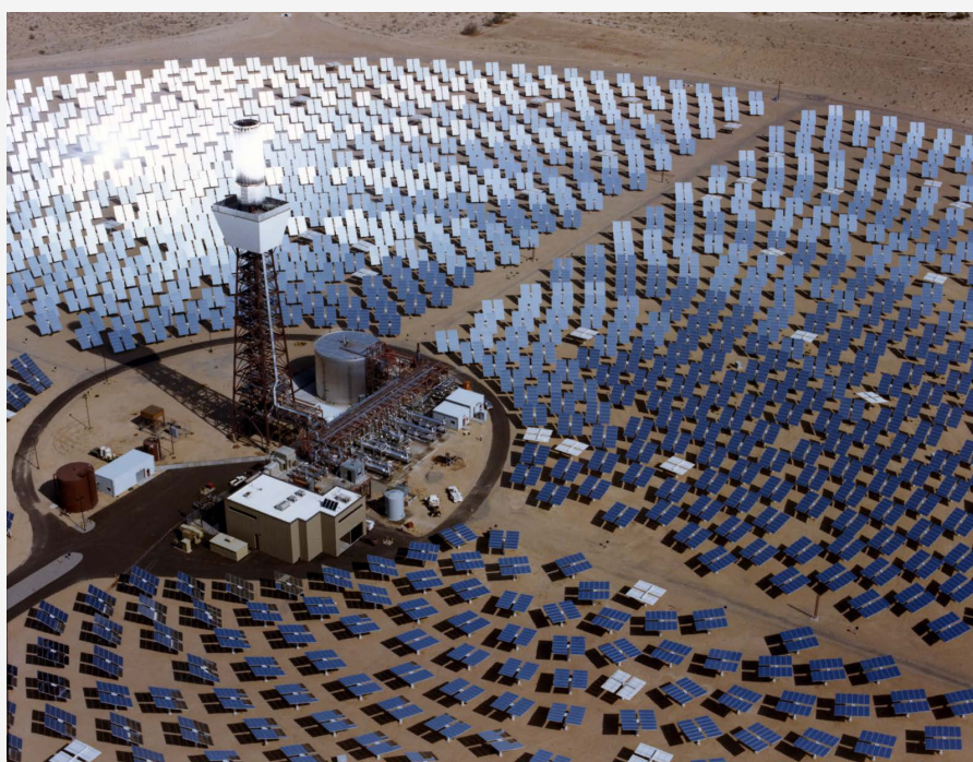
Power plant in Barstow, Mojave Desert, California, United States.

The societal and cultural implications of developments in the energy and resources sector are poorly understood. It is all too often visible that the humanities on one hand and natural and engineering sciences on the other hand live in different worlds. All too often, scientists spend little time outside the realm of their own discipline. In many cases, technically, this might work. But when it comes to challenges on historic and geo-historical scales, the lack of a broad historical perspective may also